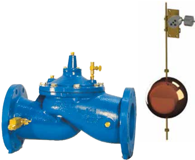
206-F-Type 5 Globe