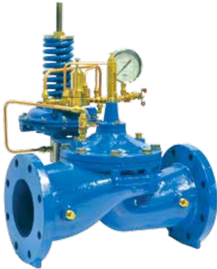
206-A-Type 4 Globe